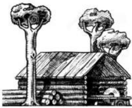
Sawmill cuts logs into boards of various sizes and quality

With substantial investment in joining and moulding technology, coating and finishing systems and significant stocks of sustainably sourced timber on site we utilise this technology, to recover and add value to timber that is destined for low value use and transform it into high value, durable timber products. This process allows the recovery of a greater amount of timber from each tree to be used for high grade products.