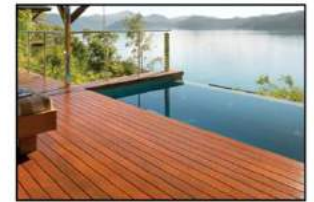
Products are fully finished ready-to-use, easy to maintain and look absolutely fantastic

Factory applied pre-coats, anti-stain, treatments and primers. Full timber surface coating by Vacuum, Flood or Spray coats. Selected surface coating by spray or brush systems. Specialist pre-coats – Fire Resistance/Flame Retardant, Termites, tannin/stain seal, preserves, oils.